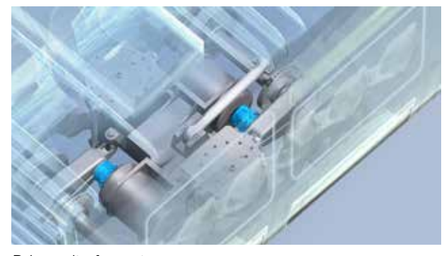
Drive unit of a metro